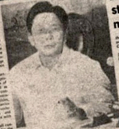
PRESIDENT MARCOS addresses nation by television broadcast.

• This is not a military takeover. Civilian government will function. The officials and employees of the national and local governments continue to discharge their duties as before within the limits of the situation. • All executive, department, bureau, office, legislative and administrative functions of the government, as well as government-owned or controlled corporations, government-owned or controlled enterprises, provinces, cities, municipalities and towns continue to function under the present officers and employees in accordance with existing laws. • The judiciary shall continue to function under the present organization and personnel and try and decide all criminal and civil cases with certain exceptions. • All schools will be closed for one week beginning this Monday for all levels. • Carrying of firearms inside the residence even if carried by license has without permission of the armed forces is prohibited. • Curfew will be imposed from 12 midnight to 4